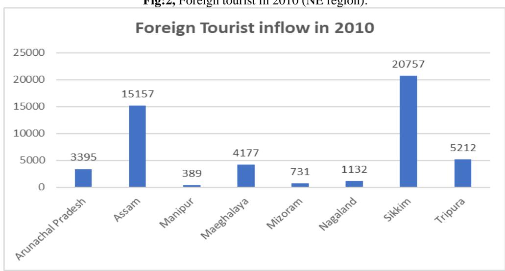
Fig:2, Foreign tourist in 2010 (NE region):

Table: 2 showed that the increasing trend of foreign tourist arrival in various states of North East India in the year 2010. In the year 2010number of Foreign Tourist Arrival was 389 in Manipur, 731 in Mizoram, 1132 in Nagaland, 3395 in Arunachal Pradesh, 4177 in Meghalaya, 5212 in Tripura, 15157 in Assam and 20757 in Sikkim respectively. Foreign Tourist Arrival in various states of North East Indiain 2010, was showed an compound growth rate of 7.45 which was found to be statistically significant at 5% probability level. This indicates the growing importance of tourism sector in various states of North Eastern regions.